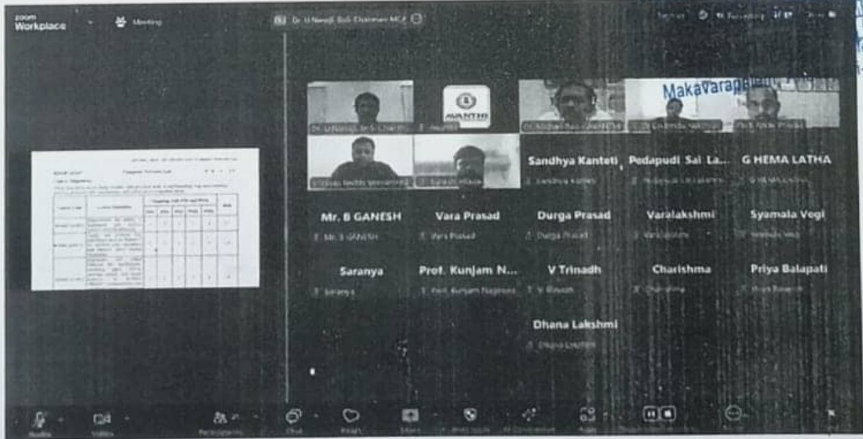
1 st Board of Studies Meeting

Makavarapalem, Anakapalle-531113 Avanthi Institute of Engineering and Technology Pin-531113